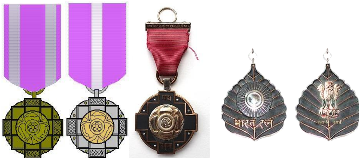
Figure-1: Padma Awards [Padma Shri, Padma Bhushan, Padma Vibhushan & Bharat Ratna.