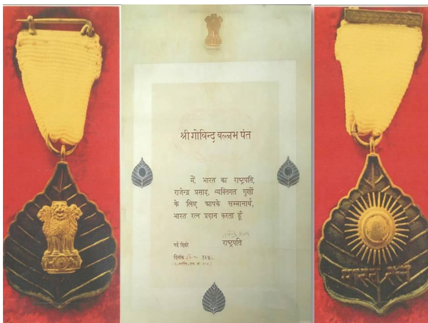
Figure-2: Certificates of civilian accolades.

The Bharat Ratna, India's highest civilian award, has been bestowed upon numerous distinguished individuals, including C. Rajagopalachari, S. Radhakrishnan, C.V. Raman (first recipients in 1954), and more recently, figures like Sachin Tendulkar, Atal Bihari Vajpayee, Pranab Mukherjee, M.S. Swaminathan, Karpoori Thakur, Lal Krishna Advani, P.V. Narasimha Rao, and Charan Singh (in 2024), recognizing contributions across politics, science, arts, and social service, with recipients spanning from early leaders like Jawaharlal Nehru to contemporary figures.